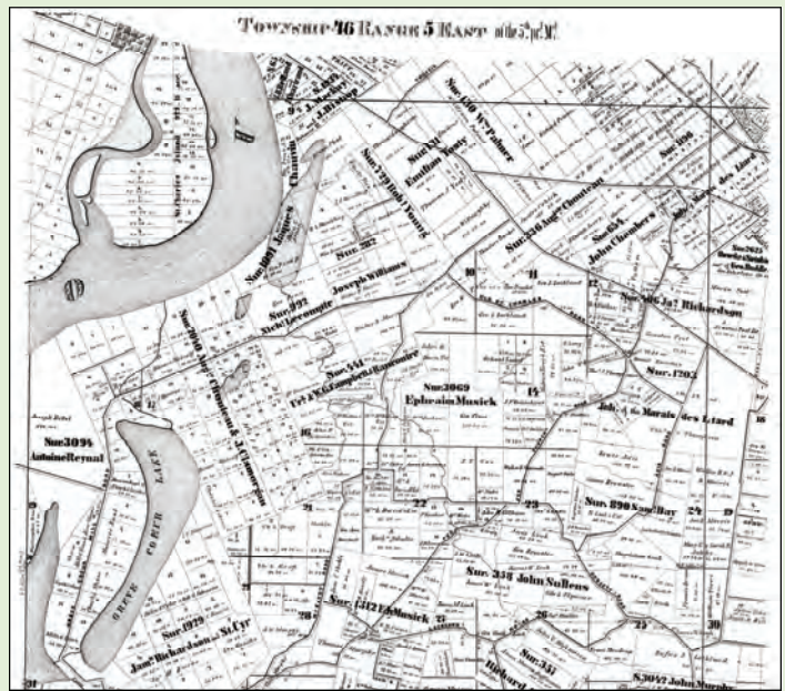
Map sections showing St. Louis County near Creve Coeur Lake in 1857 (left) and 1868.

The Special Collections Department has recently acquired microfiche of two historical St. Louis County maps included in the Library of Congress Geography and Map Division. The maps are interesting, because (among other things), they provides snapshots of St. Louis County before and after the Civil War.