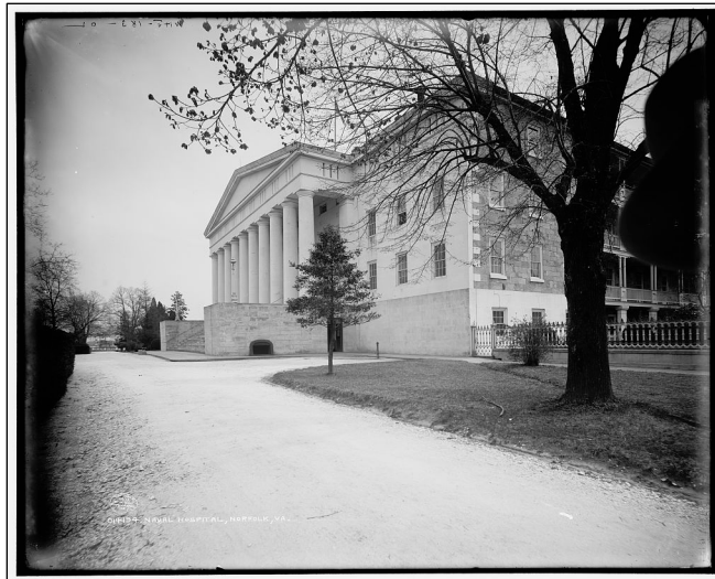
Fig. 4 | The Norfolk Naval Hospital, now Naval Medical Center Portsmouth.