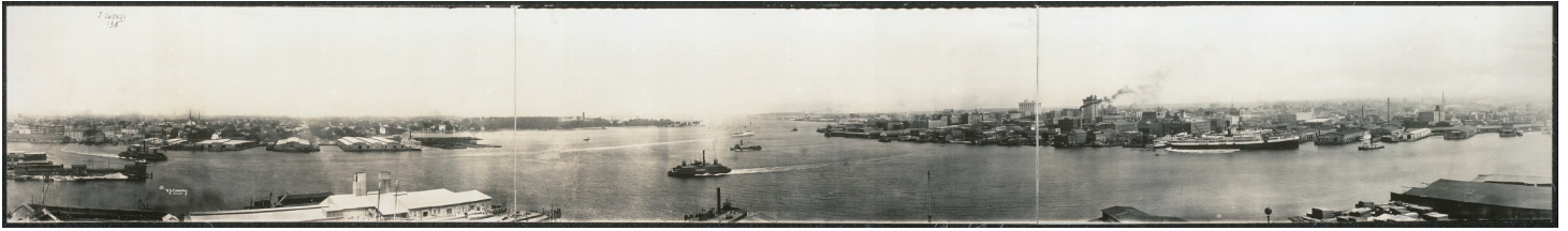
Fig. 2 | Panoramic view, Norfolk and Portsmouth water fronts and harbor.

symptoms including headache, fever, fatigue, aches, and nausea. More serious symptoms include the characteristic yellow hue to the skin, indicating liver damage, and so-called “black vomit.”